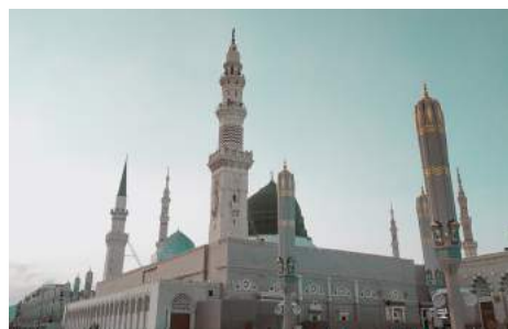
The Prophet’s Mosque, Madinah