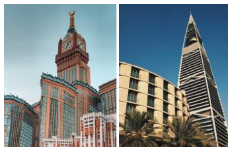
Clock Tower, Makkah