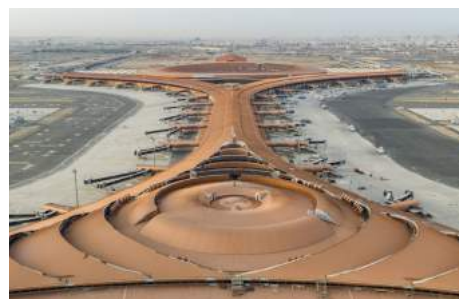
King Abdulaziz Intl. Airport, Jeddah