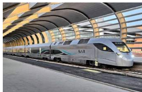
Saudi Railroad Project