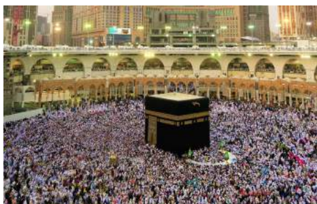
The Grand Mosque, Makkah

The Group has developed many of Saudi Arabia’s most important and iconic buildings and real estate projects, including: