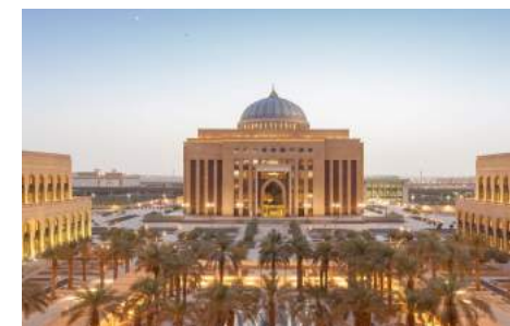
Princess Nora University, Riyadh