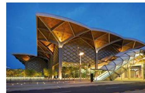
Haramain High-speed Rail Station Makkah