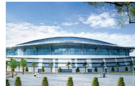
Kind Saud University Sports Facility