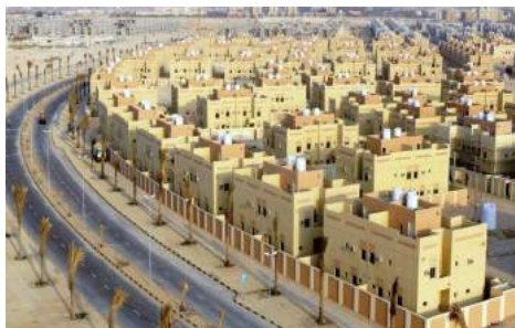
National Guard Housing Project

The Group has developed many of Saudi Arabia's most important and iconic buildings and real estate projects, including: