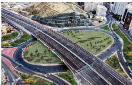
Haramain Ring Road, Makkah